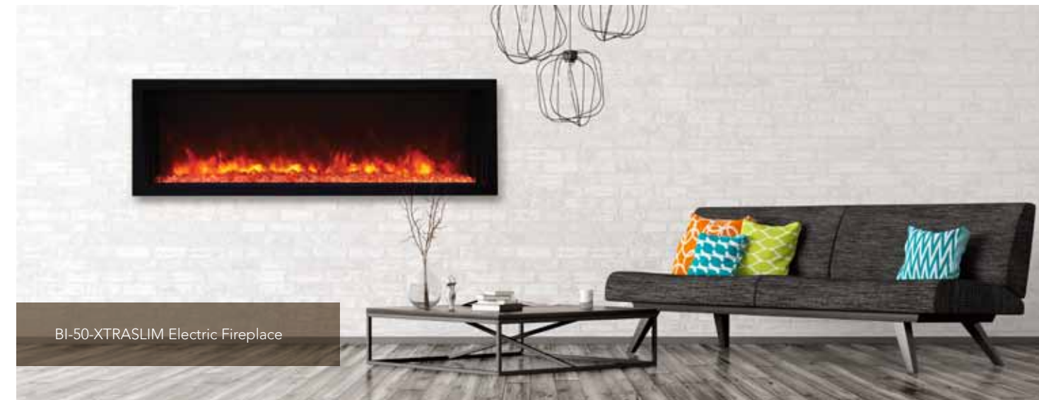
BI-50-XTRASLIM Electric Fireplace

Cover is available for additional purchase and must be used in outdoor installations