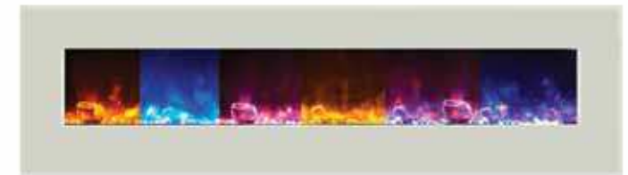
Six flame colors to choose from, changeable by remote