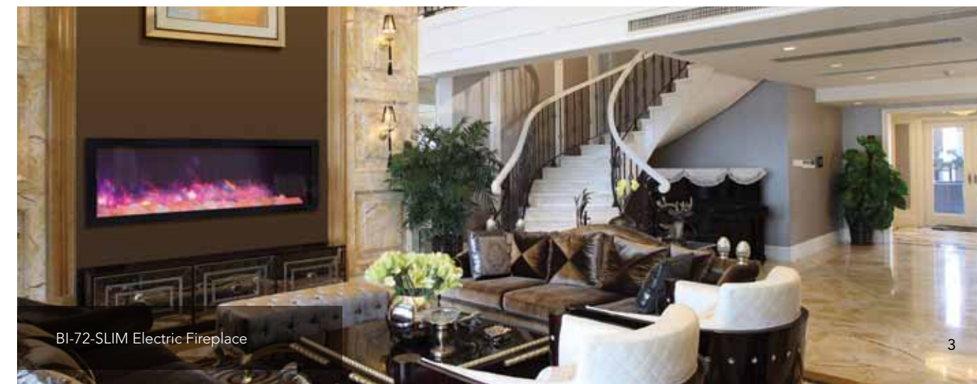
BI-72-SLIM Electric Fireplace

Cover is available for additional purchase and must be used in outdoor installations